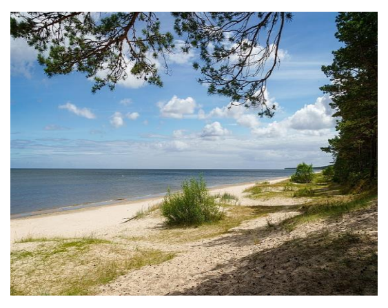
A picture of one of Latvia's many beaches. Latvia has more than 300 miles of beaches.

Did you know that over half of Latvia's territory is covered with forests? Additionally, approximately one fifth of the country is made up of nature preserves. Though it's roughly the size of West Virginia, Latvia boasts 4 national parks, 42 nature parks and 260 nature reserves. Now consider that Latvia has over 300 miles of coastal. beaches. 12.000 river sand over 2,000 lakes not to mention all wildlife contained therein. It's no